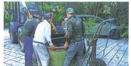
McKee staff and crew members from Aiello Landscape work to transport the donated pots onto a forklift to transport to the truck.

350 US Highway 1 in Vero Beach. Hours are Tuesday through Saturday from 10 a.m. to 5 p.m. and Sunday from noon to 5 p.m. The last admission ticket is sold at 4 p.m. The Children's Garden is open until 4:30 p.m. Admission: $15 Adults, $13 Seniors (65+)/Youth (13-17), $10 Children (2-12). McKee members and children under 2 free.