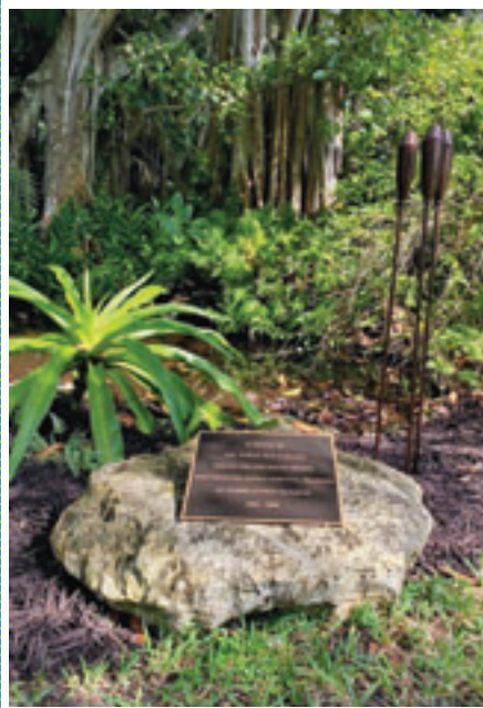
BELOW: THE COMMEMORATIVE PLAQUE PLACED UNDER A BANYAN TREE IN THE GARDEN