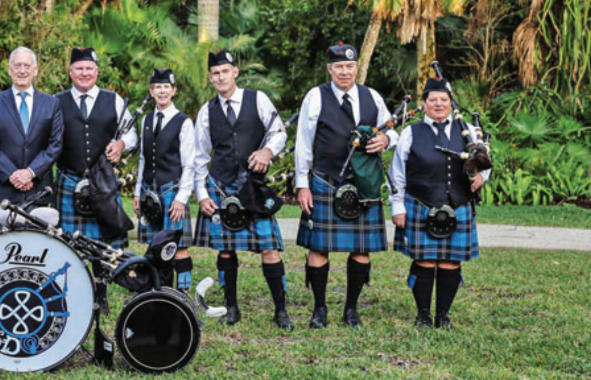
LEFT: THE VERO BEACH PIPES AND DRUMS WITH GENERAL MATTIS

McKee's board of directors, staff, volunteers and retired and active military representatives attended the dedication ceremony. The Vero Beach Pipes and Drums and the Neptune Spear Division, U.S. Naval Sea Cadet Corps Color Guard added ceremonial distinction to the occasion.