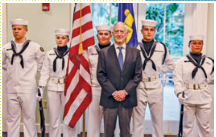
GENERAL MATTIS PICTURED WITH NEPTUNE SPEAR DIVISION, U.S. NAVAL SEA CADET CORPS COLOR GUARD

A plaque with the following inscription: IN HONOR OF THE WORLD WAR II PILOTS BOUND FOR THE SOUTH PACIFIC WHO RECEIVED JUNGLE SURVIVAL TRAINING AT MCKEE JUNGLE GARDENS 1943 – 1945, was placed just north of the Garden's library (underneath a banyan tree, next to the koi pond at what was once the entrance to the garden) to commemorate the men who participated in the training and the significant contribution the Garden played during this historic time. ■