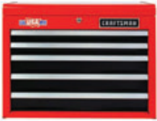
CRAFTSMAN 2000 SERIES TOOL CHEST / 26-IN W X 19.75-IN H

If you wish to donate, the Garden is in need of the following items, which can be purchased online at Amazon or Lowes.