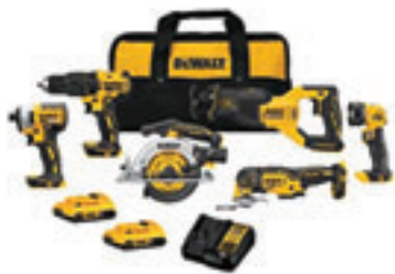
DEWALT CORDLESS COMBO KIT (DCK675D2) 20V MAX* BRUSHLESS 6-PIECE TOOL KIT