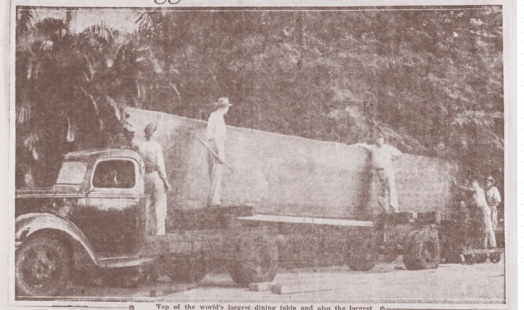
Top of the world's largest dining table and also the largest 6-man board in the world, set up at McKee Gardens, Vero Beach. The board is 3 inches thick, 4 feet wide and 35 feet long. It weighs