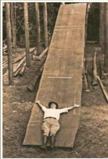
World's Biggest Board Is In Florida