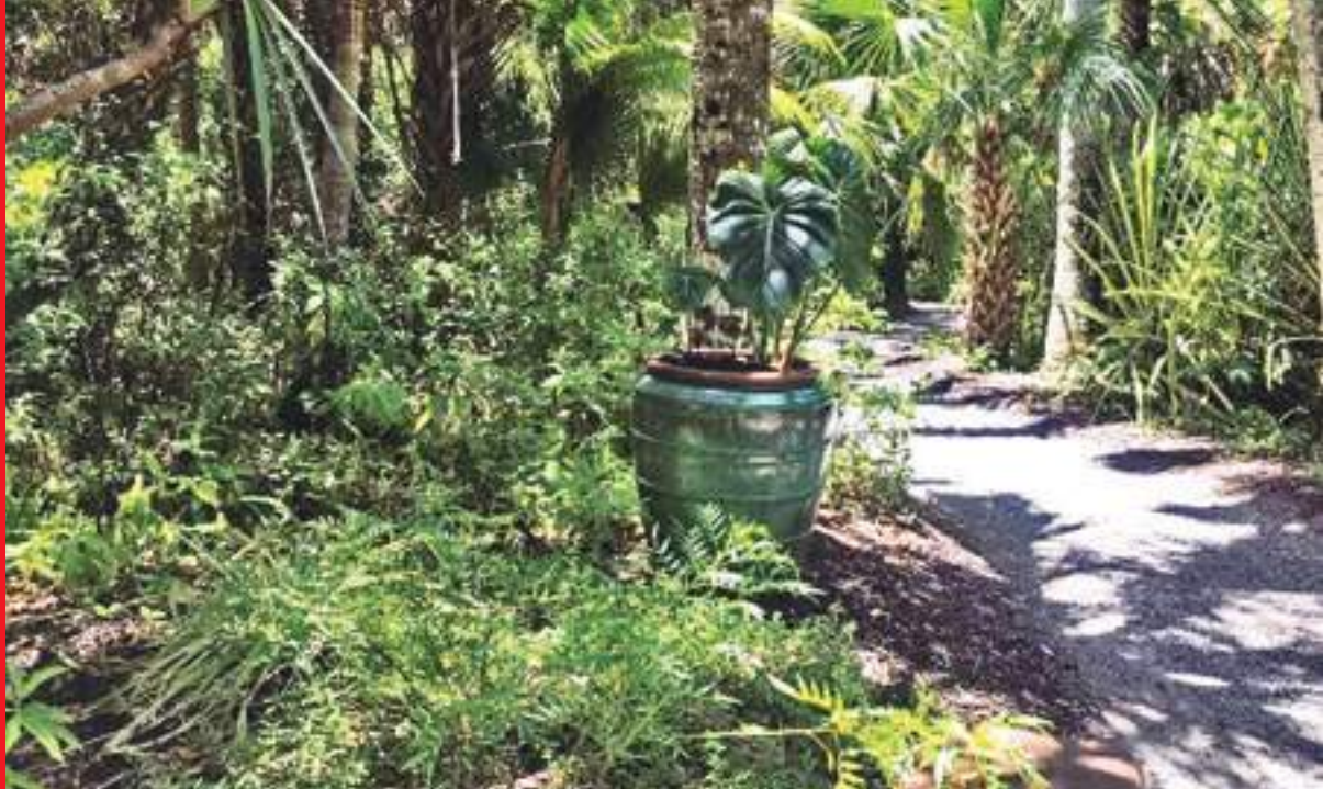
ABOVE: NATIVE CHAPMAN'S CASSIA (FOREGROUND) AND A PHILODENDRON 'MCDOWELL' (IN POT) ALONG THE OUTER BANKS TRAIL. BELOW RIGHT: A TYRANOSAURUS STALKS THE PEACEFUL GLADE BY THE MORSE MEMORIAL FOUNTAIN

COMPOSITE PHOTOS OF XAVIER CORTADA'S TILE "MURALS" FOR THE PIECES LOVE AND REVERENCE.